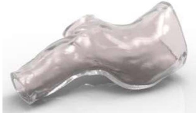
Figure 3 – Corresponding implant

The prosthesis is implanted by conventional bronchoscopy with the help of a prosthesis pusher, in the operating room under general anesthesia. In addition, the rigidity of the stent can be calculated as a function of the stenosis.